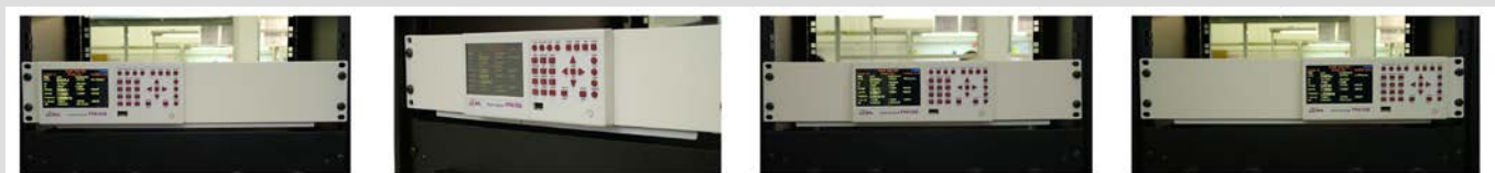
Below depicts the Twin Instrument configuration giving a convenient Six-Phase solution