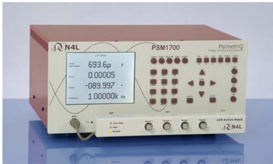
PSM1700 with LCR Active Head

The LCR Active Head and IAI convert the PSM1700/1735 units into high performance LCR meters with true 4 wire Kelvin connections that are taken directly to the component under test without the need for external shunts. Buffering, amplification and selectable shunts provide LCR measurements over a wide frequency and impedance range.