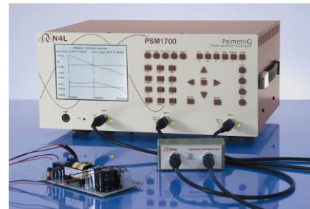
PSM1700 testing an SMPS with a standard injection transformer