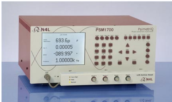
PSM1700 with LCR Active Head

The LCR Active Head and IAI convert the PSM1700/1735 units into high performance LCR meters with true 4 wire Kelvin connections that are taken directly to the component under test without the need for external shunts. Buffering, amplification and selectable shunts provide LCR measurements over a wide frequency and impedance range.